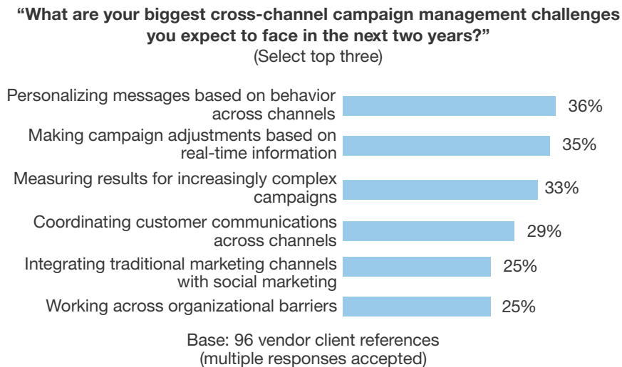
Figure 2 Most Marketers Find That Personalization Challenges Vendors